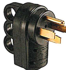
50 AMP Plug

You will be contacted no later than July 1 st confirming your reservation.