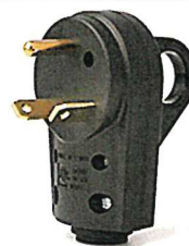
30 AMP Plug